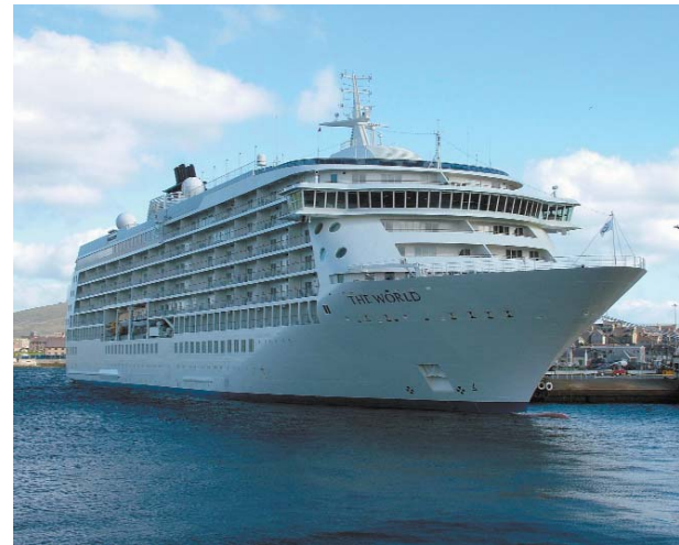
The World alongside at Lerwick