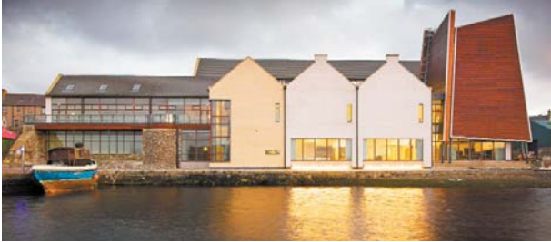
Shetland Museum and Archives