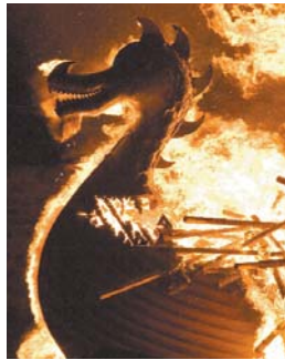
Up Helly A' Fire Festival

Shore excursion specialists, Island Vista, continue to develop new experiences for the cruise market.