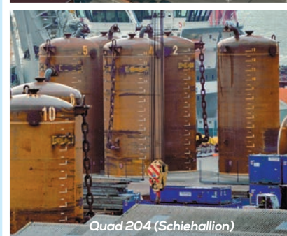
Quad 204 (Schiehallion)