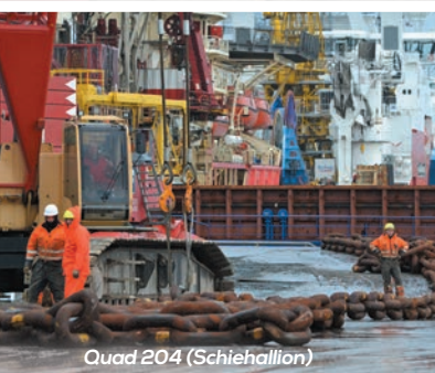
Quad 204 (Schiehallion)