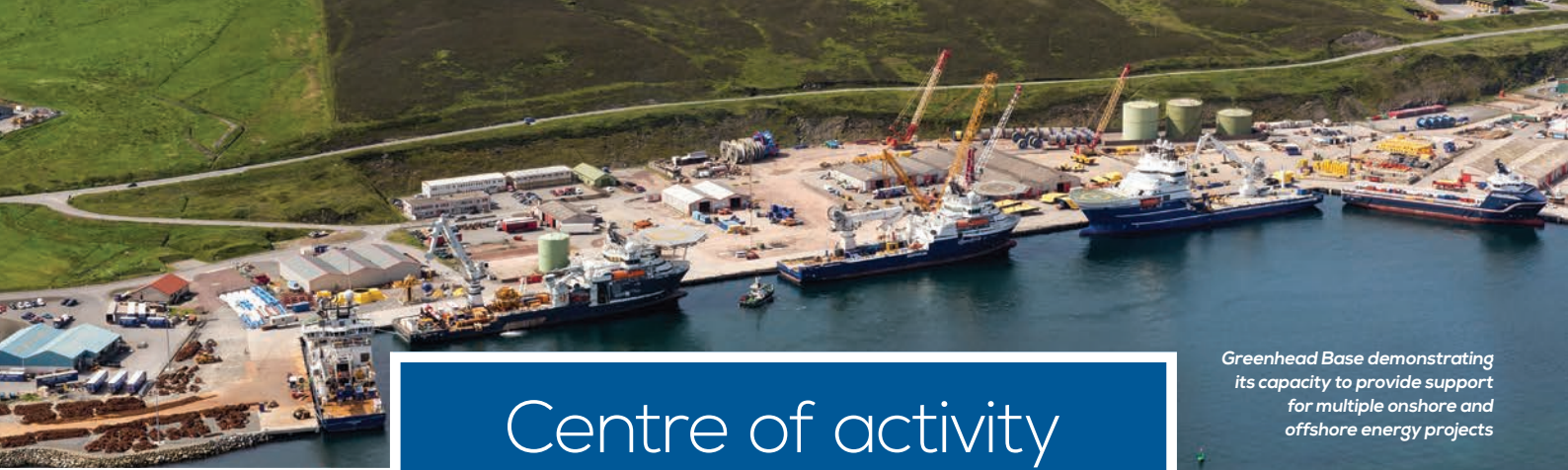
Greenhead Base demonstrating its capacity to provide support for multiple onshore and offshore energy projects